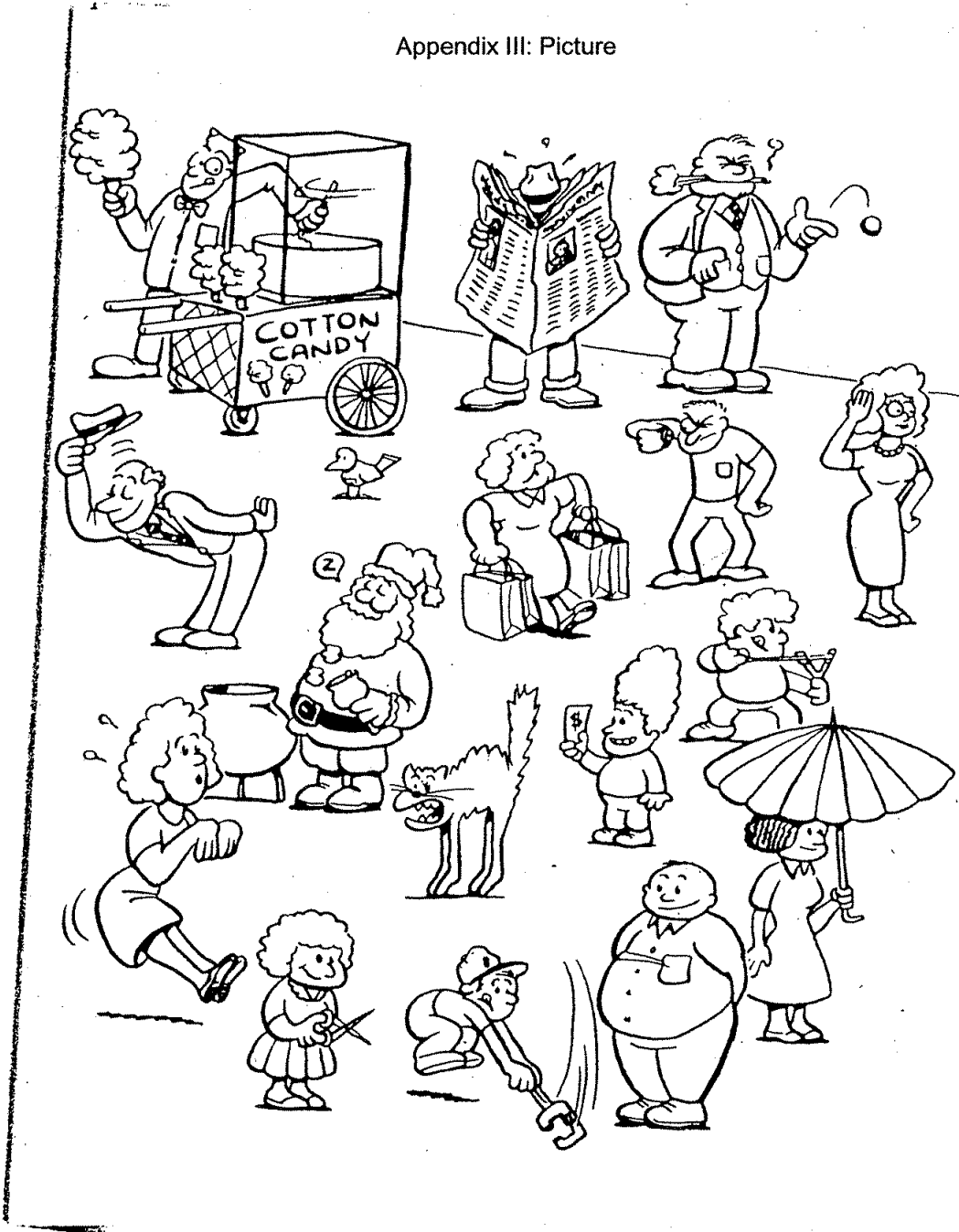
Appendix III: Picture